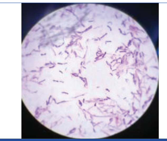
[Table/Fig-3]: Gram stain showing gram positive branching filaments. (100X oil immersion objective)

Montoux test was negative. X-ray of right wrist and forearm revealed soft tissue swelling with sclerosis of bone, focal lucencies and osteoporosis [Table/Fig-4]. Biopsy taken from the nodule including subcutaneous tissue on Haematoxylin and Eosin stain showed suppurative granulomas composed of neutrophilis surrounding characteristic grains. Surrounding neutrophilic infiltrate was a layer of histiocytes, lymphocytes, plasma cells and macrophages. The outermost layer contained fibrous tissue and layers of fibrin [Table/Fig-5].