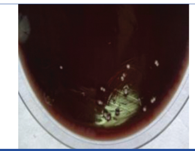
[Table/Fig-2]: Growth of chalky white granular pitted colonies on Blood agar.

Aerobic culture yielded the growth of chalky white granular pitted colonies after 1 week of incubation on blood agar [Table/Fig-2]. There was no growth on Mac Conkey agar. Gram's stain from the growth showed gram positive branching filaments [Table/Fig-3] which did not break up into bacillary forms (not fragmenting) and it was non-acid fast. Modified Kinyoun's stain with 1% sulphuric acid was negative. Catalase test was positive. The colony morphology was consistent with that of Streptomyces species since colonies were powdery, white and demonstrated an earthy odour with aerial mycelium. Other biochemical tests like hydrolysis of casein, tyrosine, xanthine, gelatine and starch could not be performed for speciating the organism. The organism did not grow on SDA and also in anaerobic environment. The organism was identified as Streptomyces species based on the morphological appearance on gram's stain, negative Modified ZN stain, growth on BA and other reactions. Antibiotic susceptibility was not performed due to poor growth on BA.