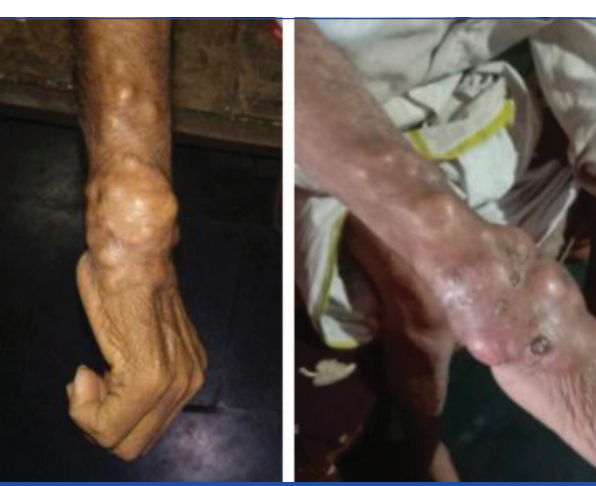
[Table/Fig-1]: Multiple swellings on right wrist and forearm.

A 53-year-old male farmer presented with multiple boggy swellings in the right wrist and forearm since 3 years [Table/Fig-1]. Initially, he had developed two nodules following which there was a gradual increase in size and the number of swellings. The patient gave history of suppuration in the swellings, vesicles formation with sero-purulent discharge (pus) exuding from multiple sites. The patient had taken treatment at various places for the same but symptoms did not subside. There was no history of fever. He was diabetic, hypertensive, had ischemic heart disease and asthma. He was on medication for the comorbidities since 10 years. The patient was treated with several oral and injectable antibiotics in the past 3 years before presenting to us.