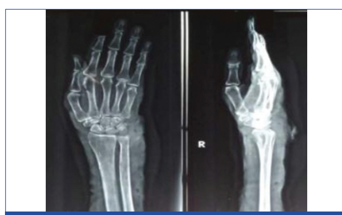
[Table/Fig-4]: Wrist radiographs showing sclerosis of bone with focal radiolucency.

Montoux test was negative. X-ray of right wrist and forearm revealed soft tissue swelling with sclerosis of bone, focal lucencies and osteoporosis [Table/Fig-4]. Biopsy taken from the nodule including subcutaneous tissue on Haematoxylin and Eosin stain showed suppurative granulomas composed of neutrophilis surrounding characteristic grains. Surrounding neutrophilic infiltrate was a layer of histiocytes, lymphocytes, plasma cells and macrophages. The outermost layer contained fibrous tissue and layers of fibrin [Table/Fig-5].